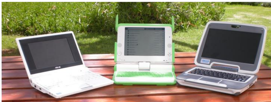
Figure 2.3: Netbooks under evaluation in this research project. From left: Asus Eee, OLPC XO and Intel Classmate

Comparative studies of netbooks carried out by Computer Aid International [2009] rank the Asus Eee PC netbook as a better choice for emerging economies. In their research, they analysed which one was best-equipped for use in developing countries. It is said to offer an ideal compromise between power consumption, performance and portability in both Linux and Windows-equipped versions [Computer Aid International, 2009]. The same study revealed that the Intel classmate was the least preferred solution due to its higher power consumption and low battery life as compared to Asus Eee [Computer Aid International, 2009].